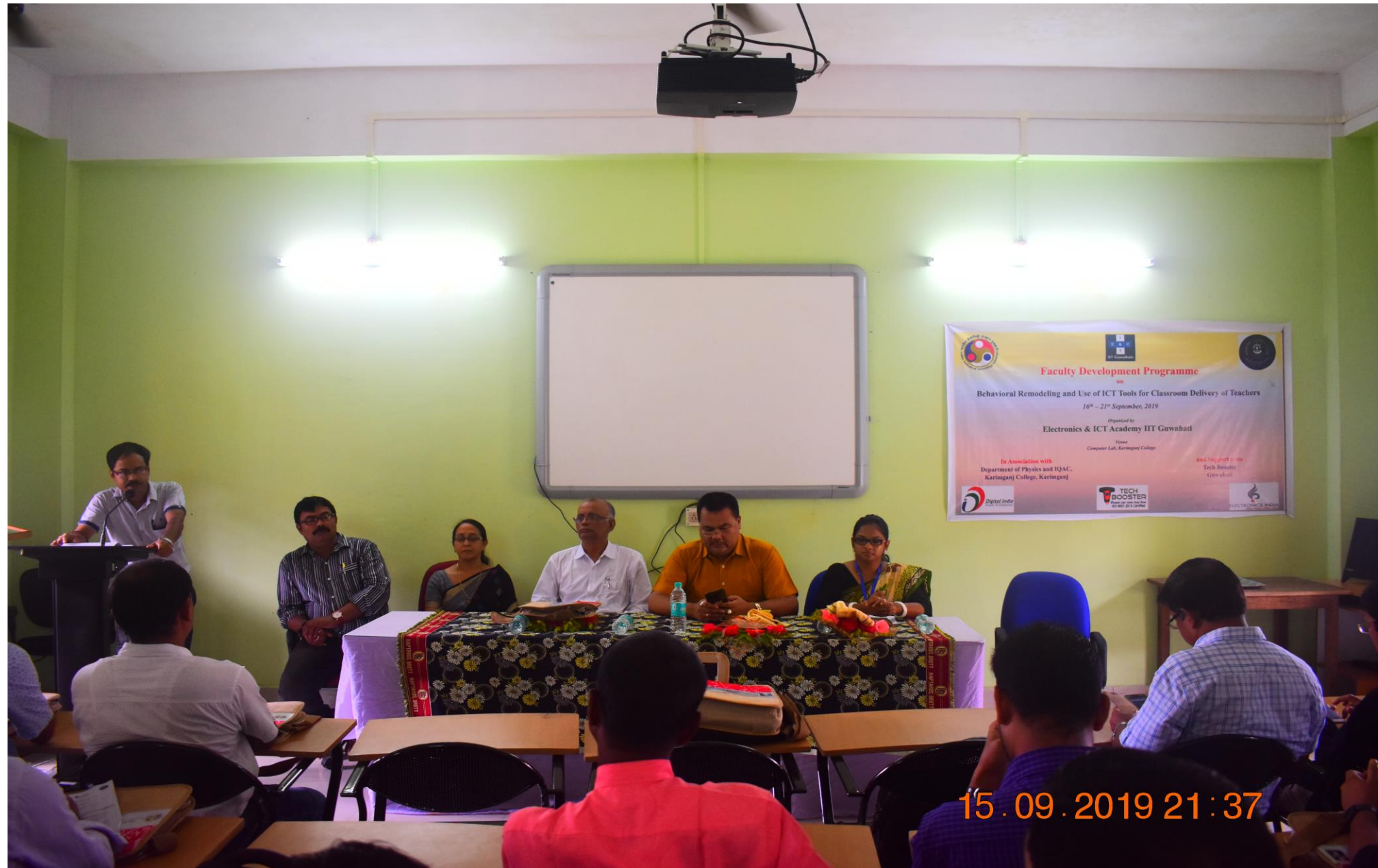
Photograph of inaugural session